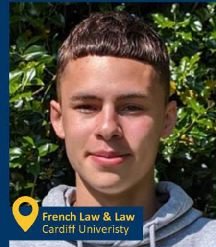
French Law & Law Cardiff University