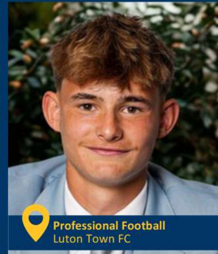
Professional Football Luton Town FC

“A community with a great sense of family, which enables you to achieve your own excellence through networks of support”