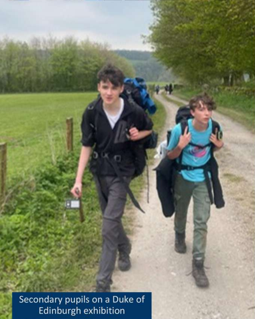
Secondary pupils on a Duke of Edinburgh exhibition

“Pupils value the many opportunities beyond the classroom...these broaden pupils’ interests, experiences and understanding of the world.” - OFSTED 2024