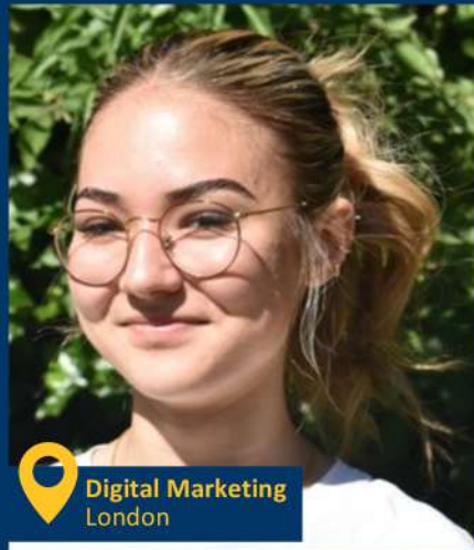
Digital Marketing London