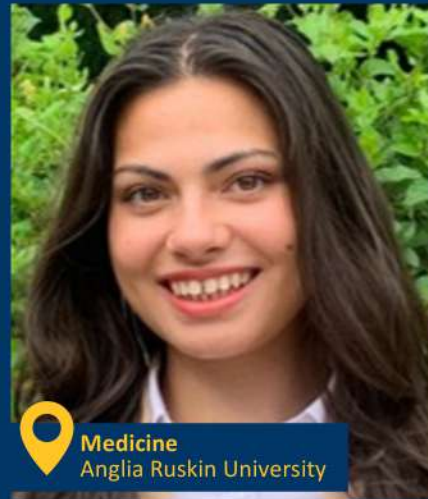
Medicine Anglia Ruskin University