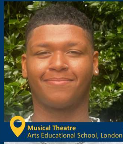
Musical Theatre Arts Educational School, London